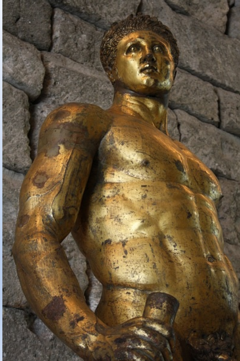
Gilded Bronze Hercules