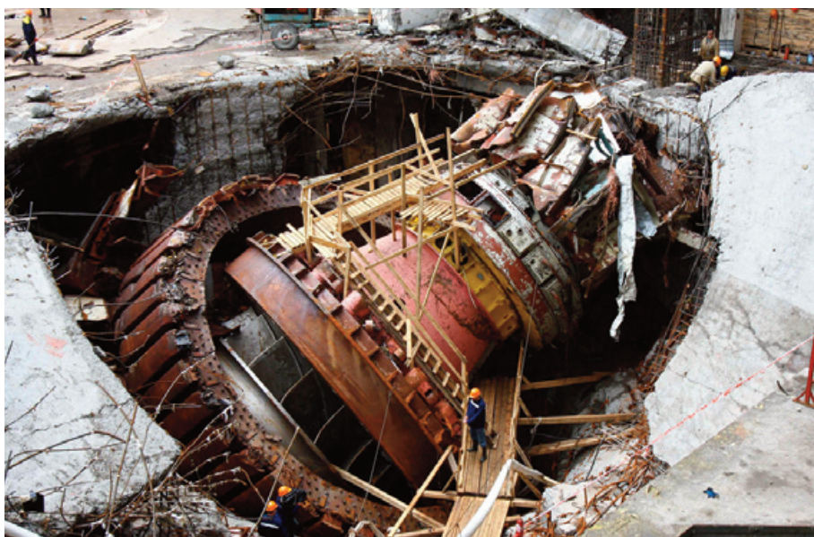
Figure 2. Part of the damage to the powerhouse after the 17 August 2009 accident. Unit 2 as seen on 3 September 2009 after dewatering.