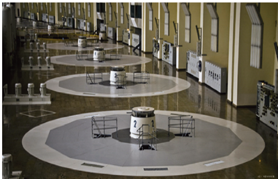
Figure 1. Sayano-Shushenskaya powerhouse machine hall operating floor prior to accident.

That reinforces the lesson from this disaster that the design limitations of the plant MUST be respected. Operator training should emphasize design limitations with particular emphasis on the operation of turbine governors, and younger operators replacing retired experts should undergo a detailed examination of the behavior of the equipment under all conditions. If necessary, manage-