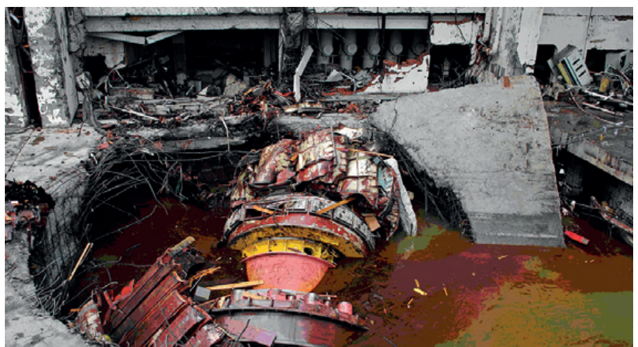
Figure 5. Unit 2 several hours after failure.

In an emotionally moving article in Siberia Realities dated 16 August 2019, journalist